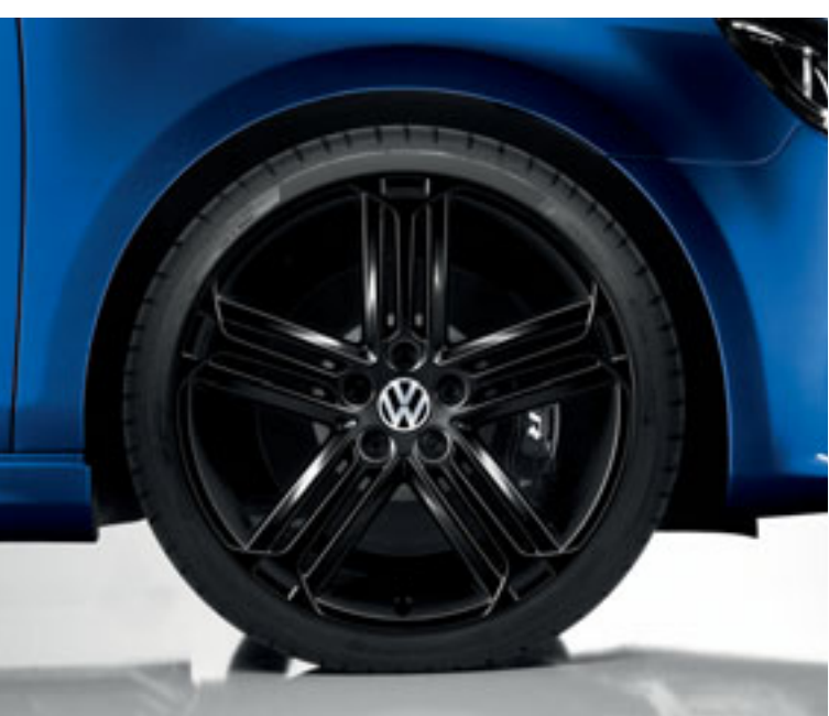
'Talladega Black' 8J x 19 light alloy wheels with 235/35 R19 tyres, includes black headlight surrounds.

Adaptive Chassis Control (ACC) adapts the damping control and shock absorption rate to the road conditions and driving style you require within milliseconds. At the touch of a button, you decide how firm or comfortable you wish to set the suspension, with a choice of three settings: Normal, Comfort or Sport.