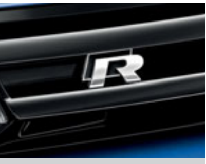
The gloss black grille with gleaming chrome 'R' badge gives the front of the new Golf R its distinctive appearance - elegant, understated, but hinting at the power within.