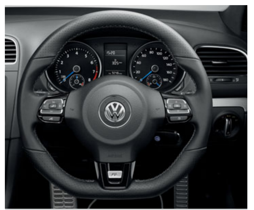
The leather trimmed three-spoke multifunction steering wheel with stylish 'R' logo, 'Gloss Black' inserts and contrast stitching enables you to control the multifunction computer and radio functions both easily and safely. Specify the new Golf R with the DSG Direct Shift Gearbox and it comes equipped with paddle shift as standard, allowing quick gear changes without taking your hands off the steering wheel.