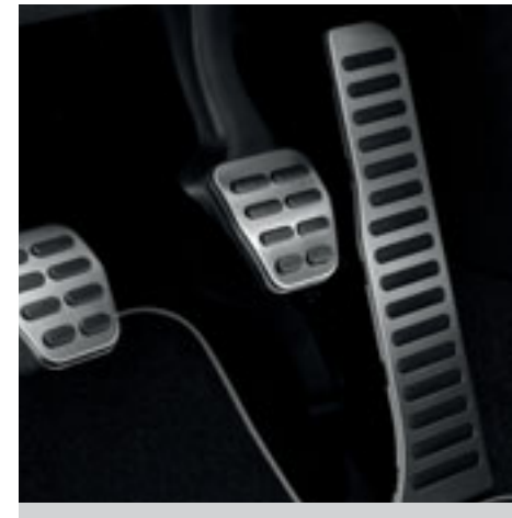
Aluminium-look pedals add a refined touch, the anti-slip cover enhancing safety and performance.

The Convenience pack comprises front footwell illumination, an automatic coming/leaving home lighting function, ensuring your surroundings are well lit. The dusk sensor activates the vehicle's headlights when light levels diminish (i.e. night driving and underground car parks), while the automatically dimming interior rear-view mirror and rain sensor provide extra safety and comfort.