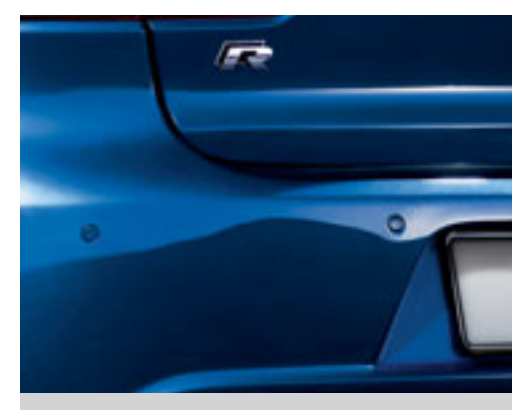
Rear parking sensors help you park your new Golf R with the greatest of ease, aided by an audible warning and a visual display via the Golf R's radio system's display.