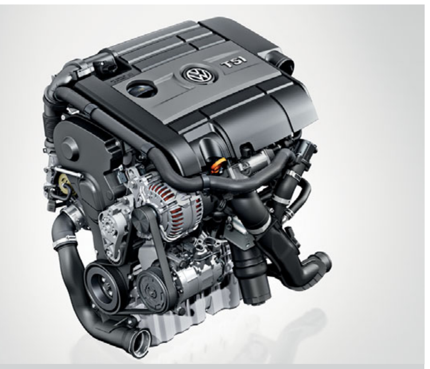
A combination of direct fuel injection and intelligent turbocharging technology ensures the 2.0 litre TSI 270 PS petrol engine delivers high performance and torque, complementing the Golf R's sporty character perfectly.

Whichever gearbox you select to couple with the phenomenal 2.0 litre TSI 270 PS engine, you can be sure of outstanding performance, excellent torque and impressive fuel consumption considering the Golf R's incredible power output. That's because advanced Volkswagen TSI engine technology delivers phenomenal results, whatever the length of your journey.