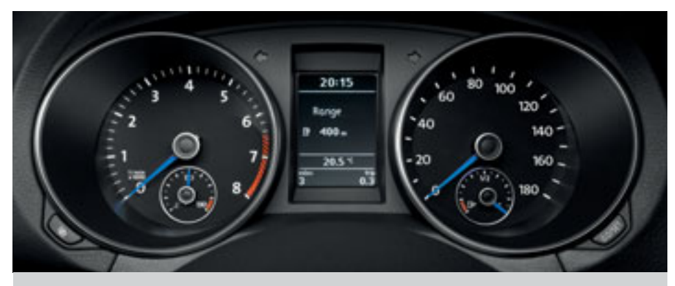
White instrument lighting, with adjustable panel illumination and blue needles, creates a sporty appearance and can easily be read, whatever the light conditions.