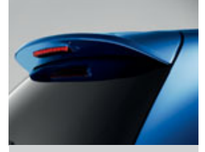
The body-coloured rear spoiler highlights the dynamic shape of the new Golf R's sporting body, while ensuring optimum roadholding through improved aerodynamics.

Bi-Xenon headlights combine dipped and main beams in one integrated unit, housed in a stylish glossy black casing that flows seamlessly into the radiator grille. Dynamic curve lighting and automatic range adjustment compensate for any change in the incline of the body, due to loading, braking or accelerating, ensuring the driver benefits continually from optimum illumination when driving at night. Newly designed separate daytime running lights utilise LED technology for clearer vision and also ensure your vehicle is visible in any weather. Headlight washers and a low washer fluid warning light are also included to help keep them clear.