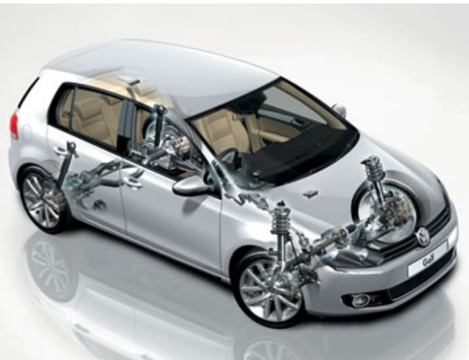
Image shown is for illustration purposes only and may not necessarily reflect UK specification.

Interior shown features optional 'Vienna' leather upholstery.