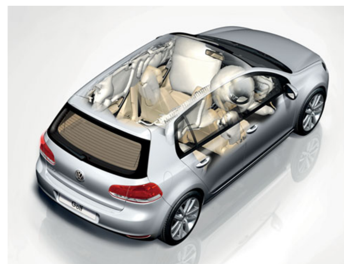
Image shown is for illustration purposes only and may not necessarily reflect UK specification.

With no one to beat but itself, the new Golf R simply goes one better in improving the already high levels of safety offered by its predecessors. The result is a range of all-round safety precautions offering maximum protection in any eventuality, once more setting the standards for others to follow.