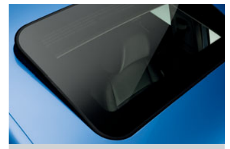
The electric glass sunroof is just as eye-catching from the outside as it is from the inside. Adding light and space, it fills the interior with additional natural light as well as fresh air.

Practical and visual extras can be an extremely useful way of creating exactly the Golf R you desire. With this in mind, a selection of different options are available, each one ensuring your Golf R meets your individual requirements. This reflection of your personality and lifestyle makes the Golf R more irresistible than ever. So, why fight the temptation?