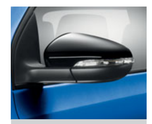
Electrically heated, adjustable and foldable door mirrors with integrated indicators can be easily operated from the comfort of the driver's seat.

Adaptive Chassis Control (ACC) adapts the damping control and shock absorption rate to the road conditions and driving style you require within milliseconds. At the touch of a button, you decide how firm or comfortable you wish to set the suspension, with a choice of three settings: Normal, Comfort or Sport.