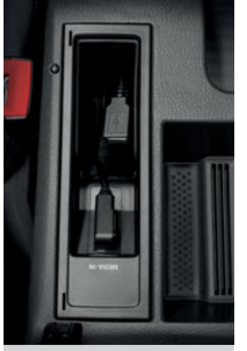
The Multi Device Interface (MDI) with iPod and USB cables enables you to connect and charge a compatible device, while track selection is viewed and selected via the RCD 310 radio system's screen.