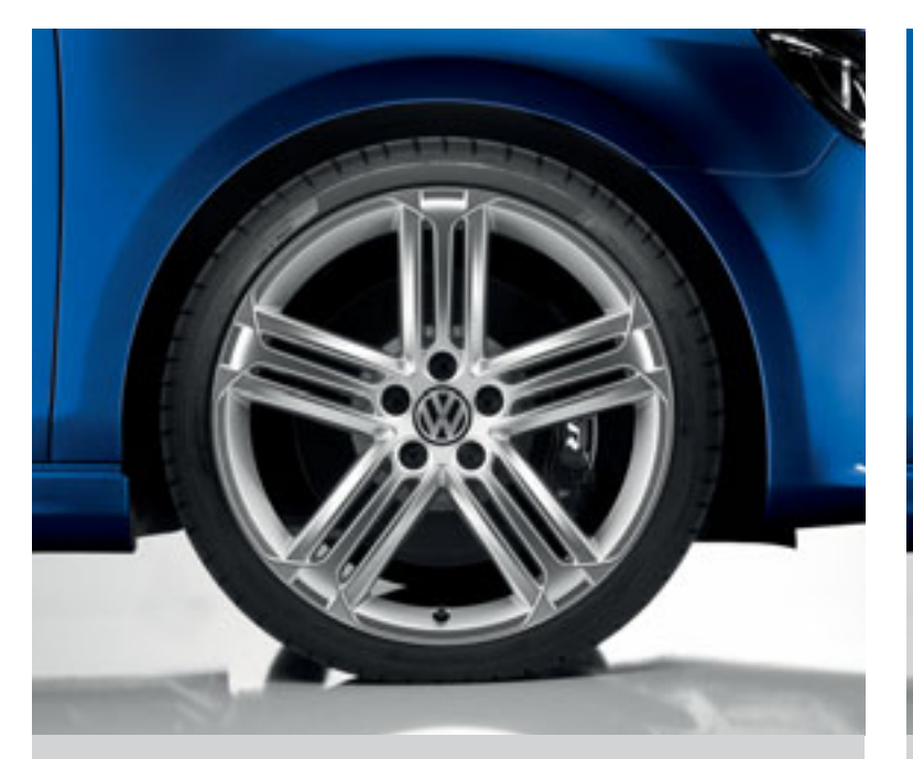
'Talladega' 8J x 19 light alloy wheels with 235/35 R19 tyres, includes black headlight surrounds.