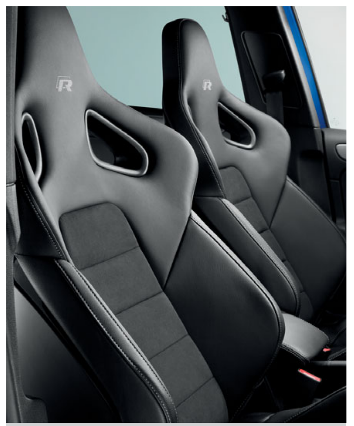
' Recaro' sports seats emphasise the motorsport look of the new Golf R. The front sports seats in 'Vienna' leather have 'San Remo' alcantara seat centre sections and are ergonomically optimised to provide outstanding lateral support.