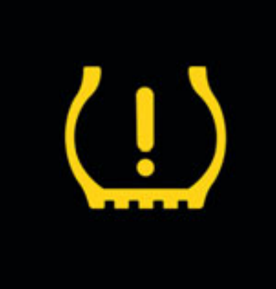
In the event of a change in air pressure, the flat tyre indicator symbol appears in the display of the multifunction computer, advising the driver to rectify the situation.

Interior shown features optional Winter pack.