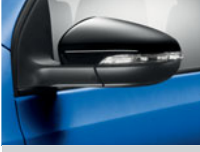
'Gloss Black' door mirrors complement the front grille perfectly, while integrated indicators are clearly visible to other road users.