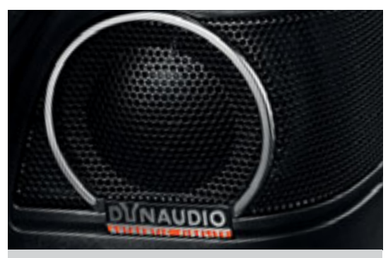
Optional in conjunction with the RCD 510 or RNS 510 DVD navigation/radio system, the 'Dynaudio' offers phenomenal sound, delivering 300 watts through eight high performance speakers, perfectly distributing acoustics throughout the vehicle.