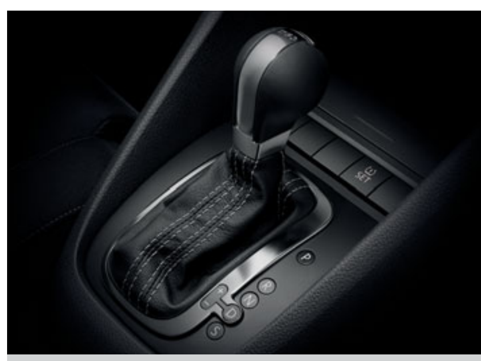
The dual-clutch Direct Shift Gearbox (DSG) represents a milestone in the development of the latest gearbox technology. This innovative automatic transmission shifts smoothly and imperceptibly into the pre-selected next gear within a split second, so not only is this six speed gearbox very dynamic, its level of efficiency is almost as economical as its manual counterpart.

The six speed manual gearbox transmits power with short, accurate shifts and very smooth handling, making it easy to drive at the right engine speed.