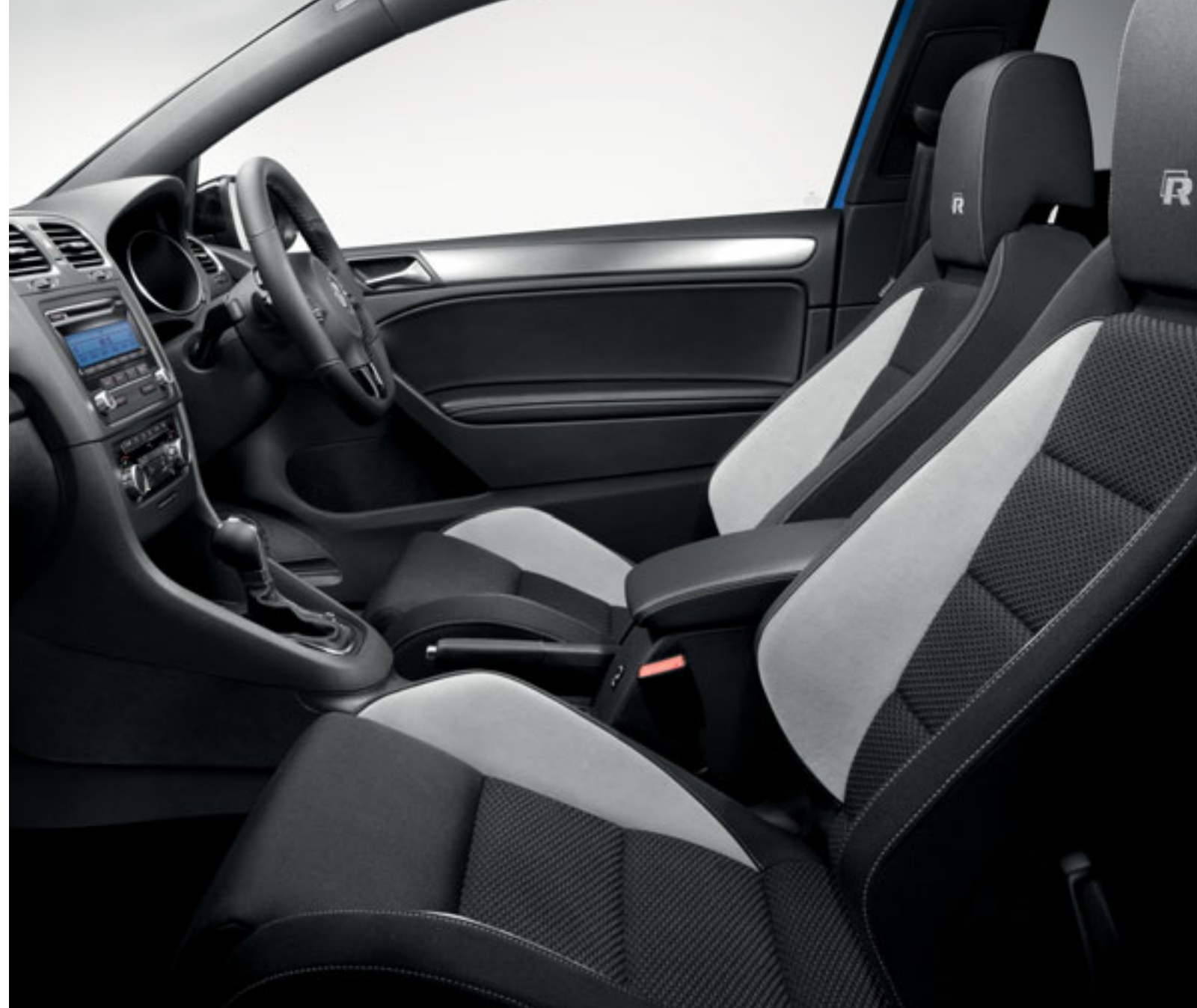
Eye-catching 'R' styling continues throughout the passenger compartment, which boasts the finest quality materials and the highest standards of craftsmanship. The front seats are upholstered in attractive Black 'Kyalami' cloth with side bolsters in Crystal Grey 'San Remo' alcantara, providing a sporty contemporary look. Contrast stitching provides the perfect finishing touch. Other stylish features include the 'R' logo on the head restraints of the front sports seats, an 'R' styled gear lever knob, 'R' kick plates and 'Silver Lane' decorative inserts in the dash. All combine to give the interior a real sports identity, and making any journey in the new Golf R one of pure, unadulterated excitement.

Model shown is Golf R 2.0 litre 270 PS DSG with metallic paint.