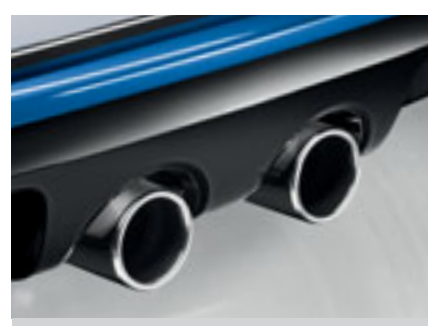
The chrome twin centre exhaust tailpipe is a unique design feature of the new Golf R, delivering the sound of the engine to the road.