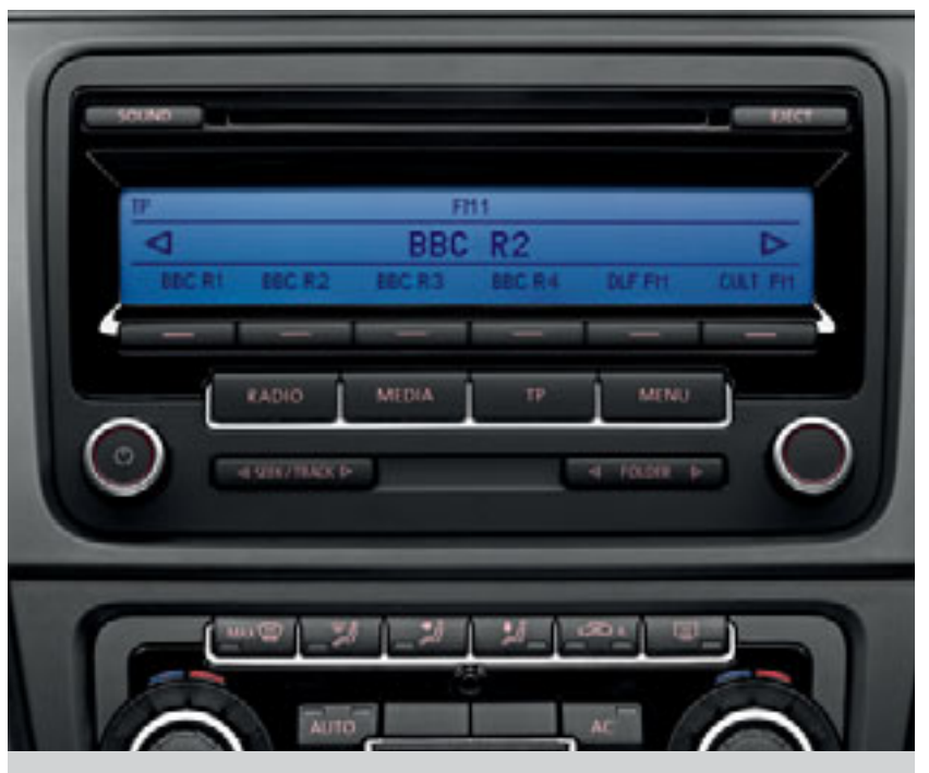
The RCD 310 radio/MP3 compatible CD player features eight speakers with an output of 4 x 20 watts, four in the front and four in the rear, plays files in MP3 and WMA formats, and also has an AUX-in socket for connection to an external multimedia source, such as an iPod or MP3 player.