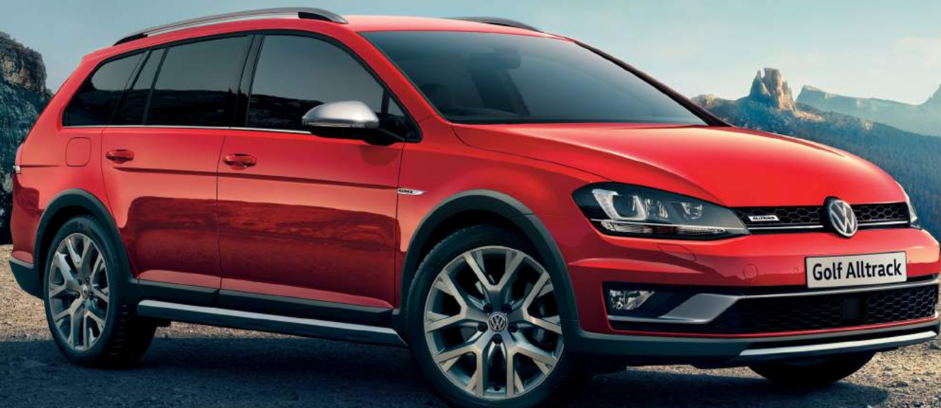
Model shown is Golf Alltrack with optional 18" 'Canyon' alloy wheels and Tornado Red non-metallic paint.