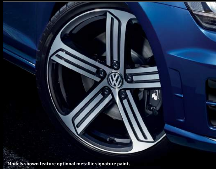
Models shown feature optional metallic signature paint.

* Please note these models are only available from stock and are not available to factory order.