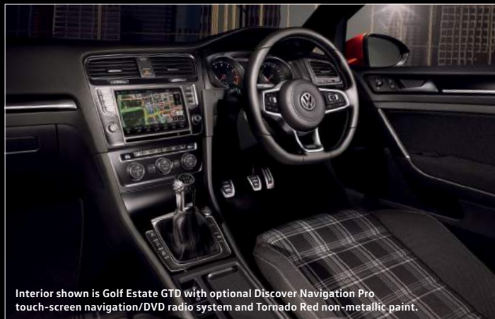
Interior shown is Golf Estate GTD with optional Discover Navigation Pro touch-screen navigation/DVD radio system and Tornado Red non-metallic paint.

Model shown features optional Tornado Red non-metallic paint.