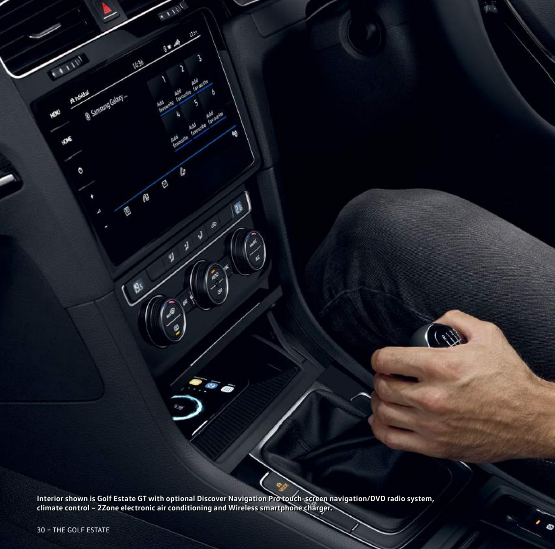
Interior shown is Golf Estate GT with optional Discover Navigation Pro touch-screen navigation/DVD radio system, climate control – 2Zone electronic air conditioning and Wireless smartphone charger.

The way VED (Vehicle Excise Duty) vehicle tax is calculated will change for vehicles that are first registered with DVLA on, or after, 1 April 2017.