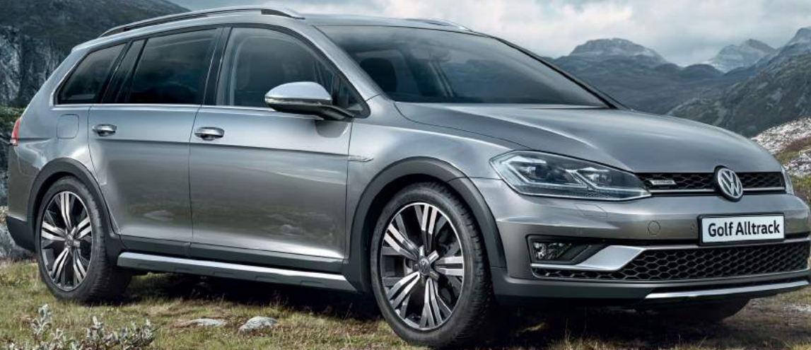
Model shown is Golf Alltrack with optional 18" 'Kalamata' alloy wheels and metallic paint.