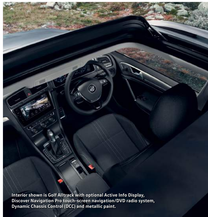
Interior shown is Golf Alltrack with optional Active Info Display, Discover Navigation Pro touch-screen navigation/DVD radio system, Dynamic Chassis Control (DCC) and metallic paint.

Off-road setting, including hill descent assist