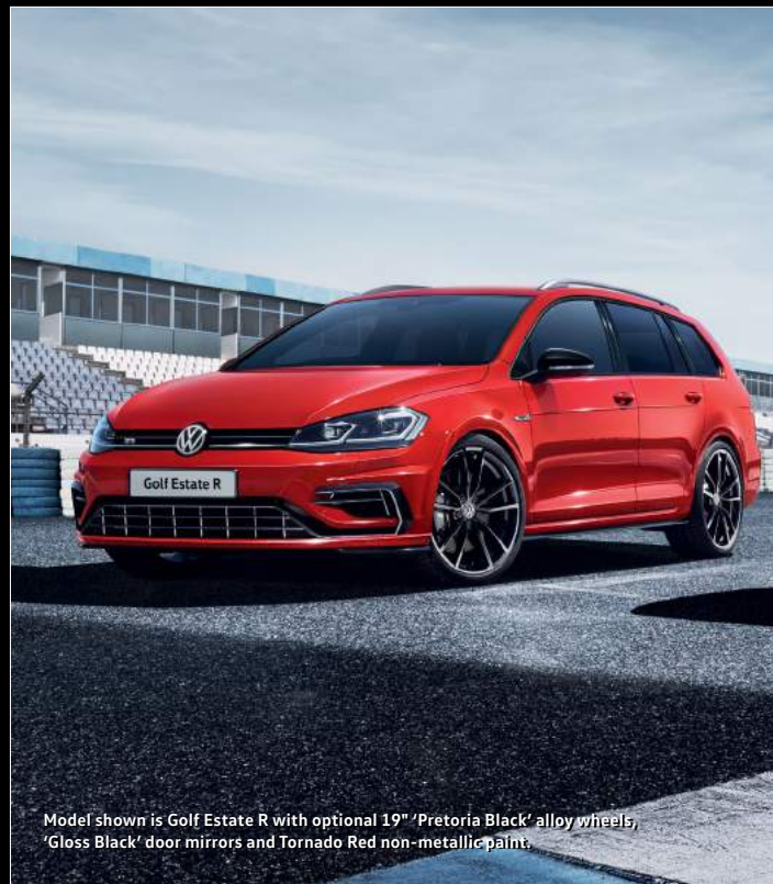
Model shown is Golf Estate R with optional 19" 'Pretoria Black' alloy wheels, 'Gloss Black' door mirrors and Tornado Red non-metallic paint.

The specifications listed are for information purposes only as our products are continually updated and changes may be made to the specifications at any time. If you require any specific feature, please consult your authorised Volkswagen retailer who is regularly updated with any change in specification. Specifications are subject to change without notice.