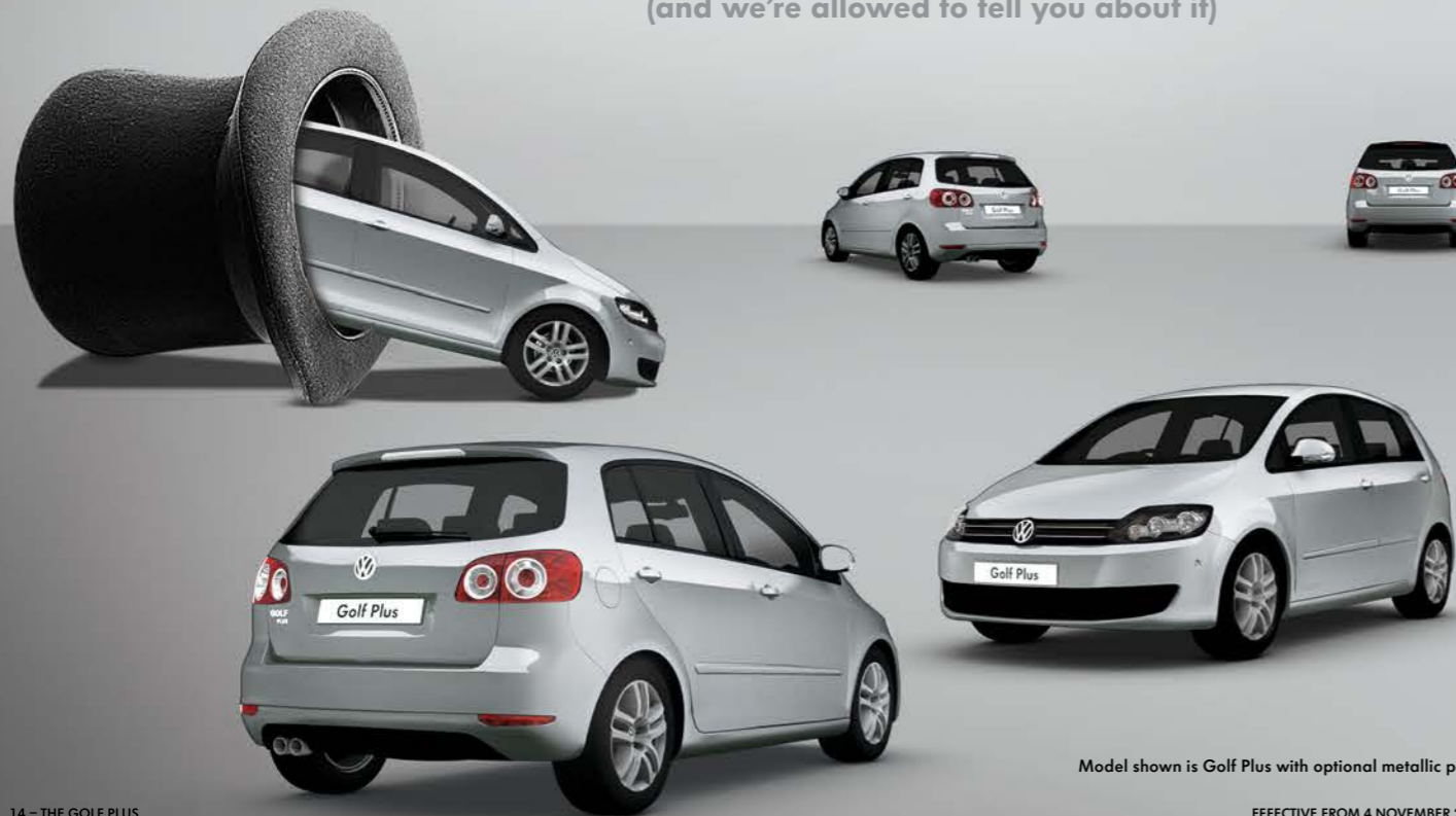
Model shown is Golf Plus with optional metallic paint.

(and we're allowed to tell you about it)