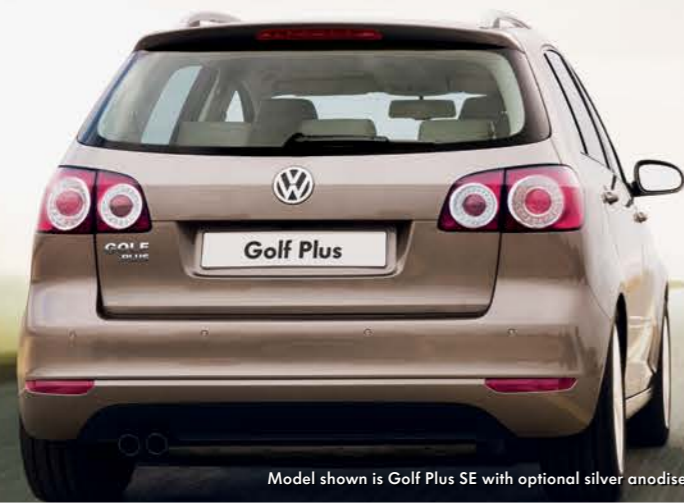
Model shown is Golf Plus SE with optional silver anodised roof rails, 17" 'Seattle' alloy wheels, 'Vienna' leather upholstery and metallic paint.