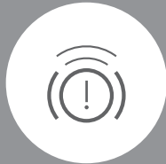
02. CITY EMERGENCY BRAKING PACK