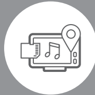
03. 'MAPS & MORE'