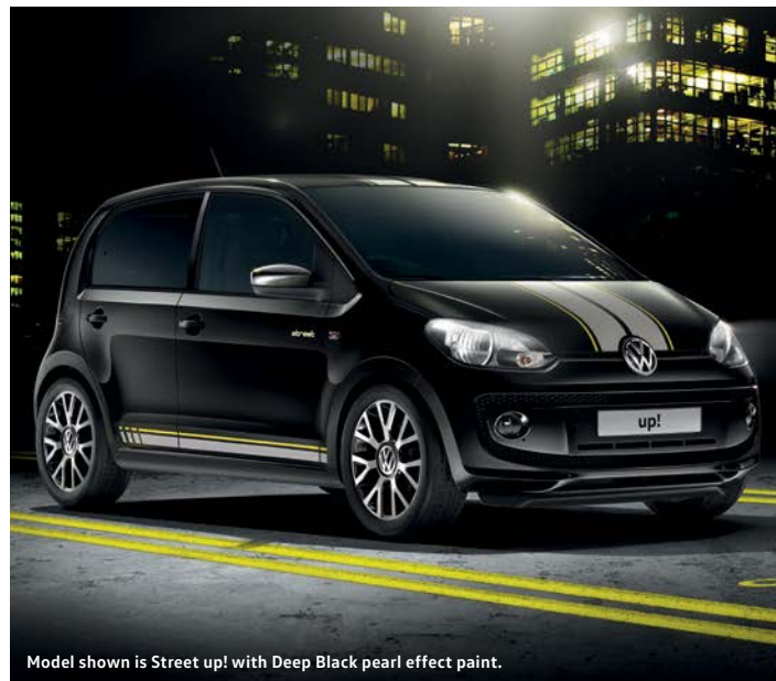
Model shown is Street up! with Deep Black pearl effect paint.