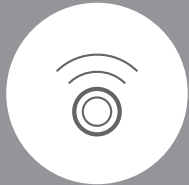
01. SENSOR PACK