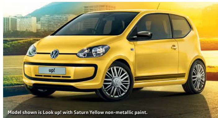
Model shown is Look up! with Saturn Yellow non-metallic paint.