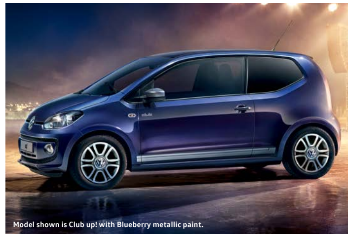
Model shown is Club up! with Blueberry metallic paint.