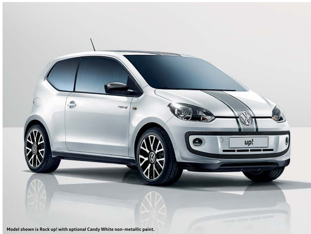
Model shown is Rock up! with optional Candy White non-metallic paint.

The specifications listed are for information purposes only as our products are continually updated and changes may be made to the specifications at any time. If you require any specific feature, please consult your authorised Volkswagen retailer who is regularly updated with any change in specification. Specifications are subject to change without notice.