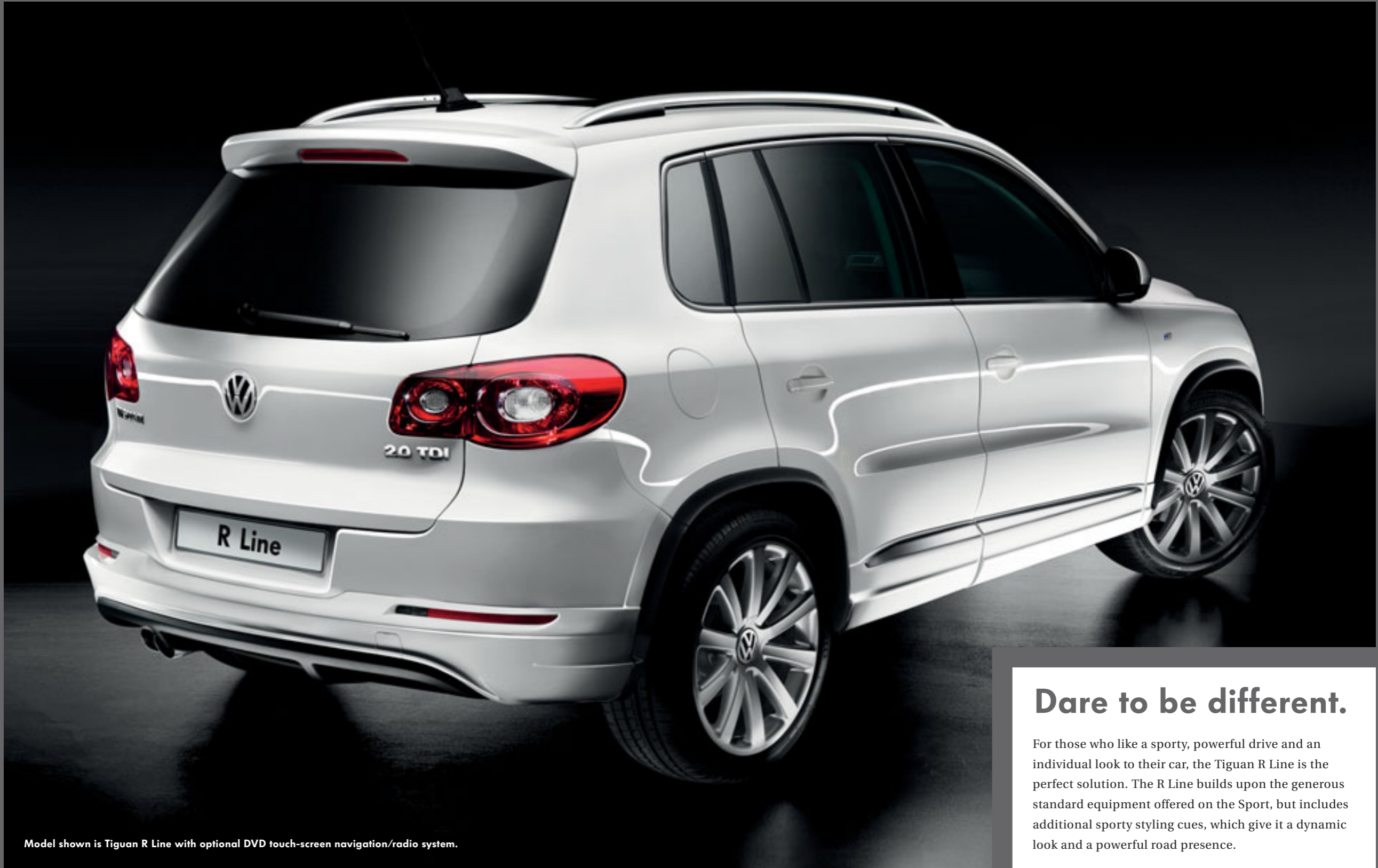
Model shown is Tiguan R Line with optional DVD touch-screen navigation/radio system.

Dare to be different. For those who like a sporty, powerful drive and an individual look to their car, the Tiguan R Line is the perfect solution. The R Line builds upon the generous standard equipment offered on the Sport, but includes additional sporty styling cues, which give it a dynamic look and a powerful road presence.