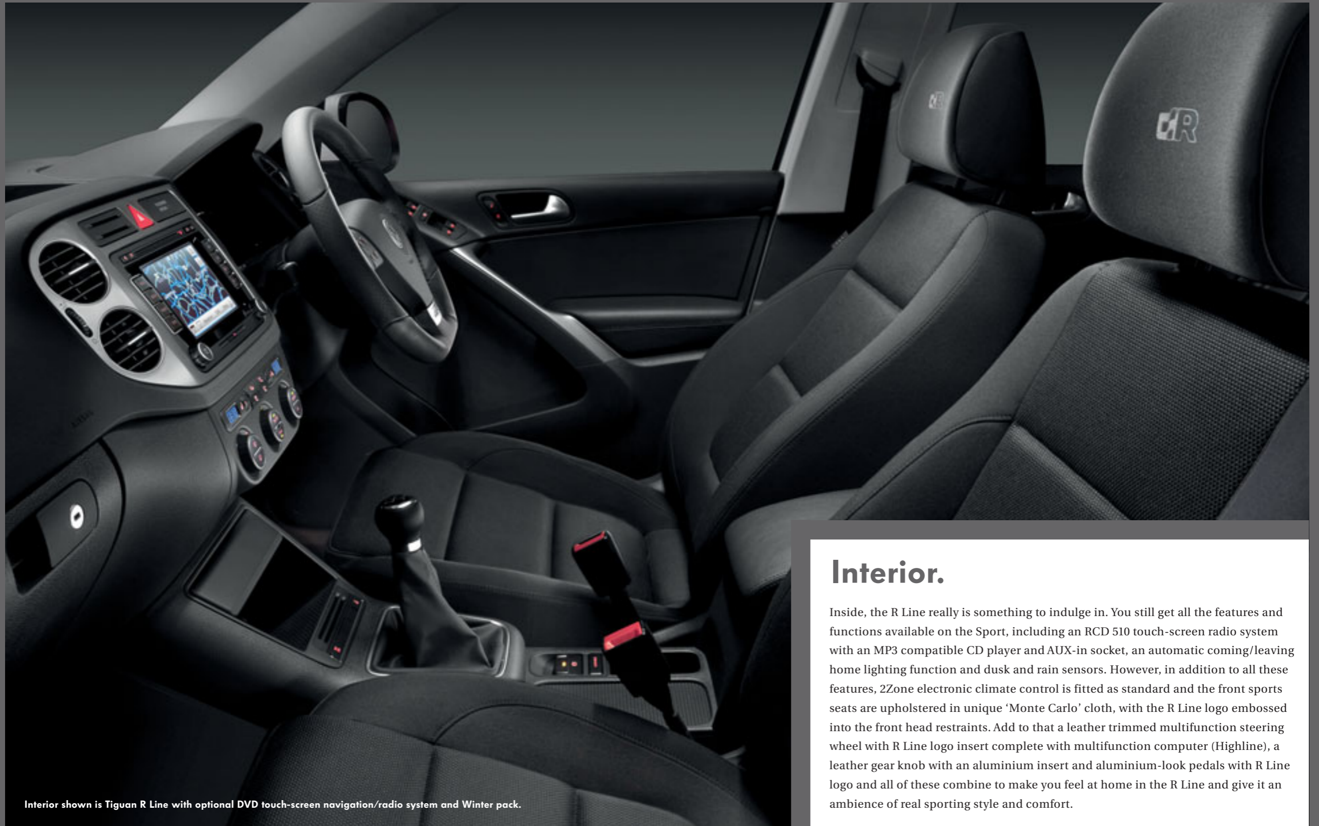
Interior shown is Tiguan R Line with optional DVD touch-screen navigation/radio system and Winter pack.