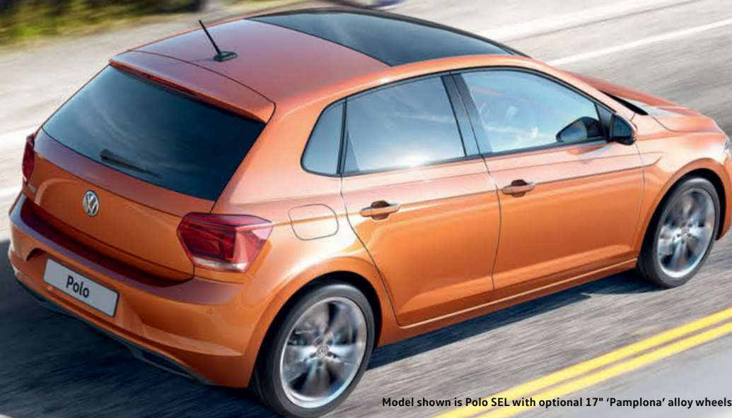
Model shown is Polo SEL with optional 17" 'Pamplona' alloy wheels, panoramic sunroof and metallic paint.