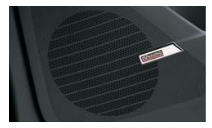
The 'Dynaudio' sound system ensures exceptional sound quality. Producing a 300 watt output through ten perfectly harmonised speakers, this is the ultimate addition to any compatible navigation/radio or radio system. Optional on SE, Sport and Escape models.