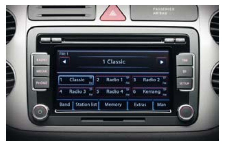
Dynamic: The RCD 510 touch-screen radio/dash-mounted MP3 compatible six CD autochanger with eight speakers and AUX-in socket for connection to an external multimedia source e.g. iPod and MP3 player.

For those seeking an extra touch of luxury, the Tiguan SE more than delivers. In fact, from the minute you see the 17 inch 'Sahara' alloy wheels, heat insulating tinted glass from the B pillar back, chrome-plated roof rails and chrome trimmed side window surrounds, you'll know it's really something special. Stylish 'Energy' cloth upholstery, 'Soft silver' decorative inserts and a leather-trimmed three-spoke steering wheel and gear knob create an interior that is as sumptuous as it is stylish, while front comfort seats with height and lumbar adjustment ensure the most comfortable seating positions on every journey. The RCD 510 touch-screen radio/dashmounted MP3 compatible six CD autochanger with eight speakers adds even greater pleasure to your trip and there is also an AUX-in socket for connection to an external multimedia source such as an iPod or MP3 player.