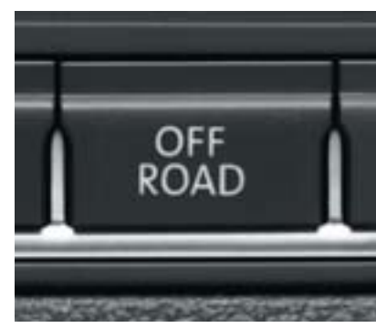
Control: The off-road mode includes hill descent assist and ABS adjusted to suit loose ground.

It's not by chance the Tiguan Escape got its name. With the capability to tackle nearly any terrain, this is exactly what it enables you to do. Explore uncharted territory and escape into the great unknown, all in the highest levels of luxury and comfort. The off-road design of the Escape is distinct from the S, SE and Sport models, with a front 28° module allowing it to traverse a larger angle of approach (from a horizontal surface to a gradient), while underbody protection at the front protects against ground contact. Front fog lights, 17 inch 'Tunis' alloy wheels, protective side bump strips, chrome trimmed radiator grille surround and louvres, and black roof rails, all add a real sense of style.