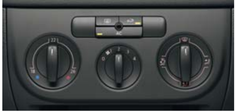
Comfortable: 'Climatic' air conditioning with semi-automatic control provides a pleasant, consistent temperature all year round.

The high interior specification of the Tiguan S clearly extends to the stylish exterior – 16 inch 'Cairo' alloy wheels, a side and rear protection pack, including wheel arch protection and an 18° front module (a figure that defines the angle of slope the Tiguan can traverse), chrome trimmed radiator grille surround and louvres, and black roof rails confirm this, whilst body-coloured front bumper, door handles and door mirrors complete its impressive appearance. If you haven't already gathered, the Tiguan S offers so much, it has to be seen to be appreciated.