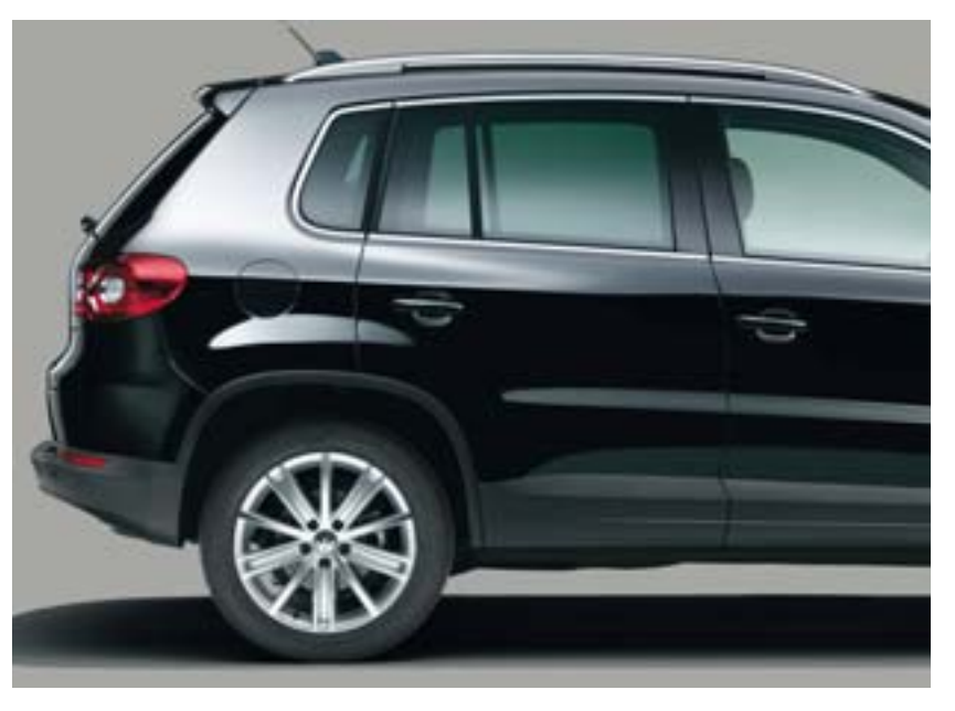
Sporty: Black wheel arch protection and 18" 'Sierra' alloy wheels emphasise the dynamic lines of the Tiguan Sport.

It is extras such as these that make all the difference. Add to that a multifunction computer (Midline) providing essential information while you drive and the RCD 510 touch-screen radio/dash-mounted MP3 compatible six CD autochanger with eight speakers providing incredible acoustics. For even greater pleasure, it has an AUX-in socket for connection to an external multimedia source such as an iPod or MP3 player so you can see why the Tiguan Sport is such a formidable package.