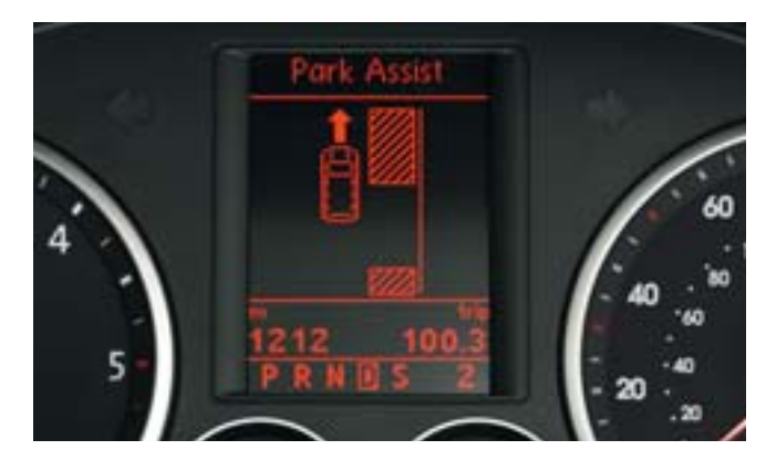
The 'Park Assist' system helps you parallel park with the greatest of ease. While driving past with the appropriate indicator on, at speeds up to 19 mph, ultrasonic sensors detect a suitable parking space and you will be informed via the multifunction display.