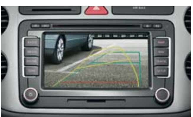
The innovative rear-view camera, part of the optional DVD touch-screen navigation/radio system, provides additional help by displaying a clear view of the area behind your vehicle via the high resolution screen. Optional on all models.