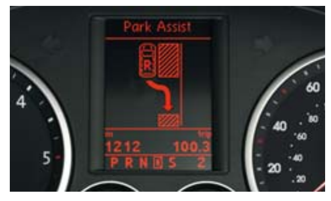
As you select reverse gear, the parking guidance assistant automatically takes over the steering, you use the clutch, brake and accelerator to ease into the space. Audible parking sensors notify you of your distance to obstacles both in front and behind you while an optical display, via the vehicle's audio system, will combine to assist you when to stop. Optional on all models.