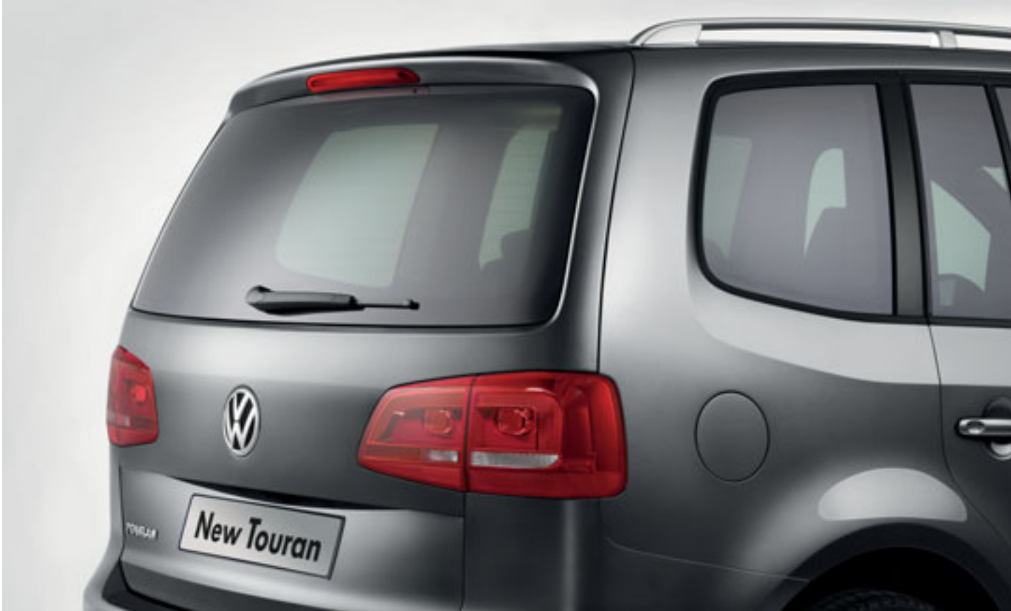
The rear design of the new Touran has been remodelled to reflect contemporary styling, with a body-coloured bumper and integrated roof spoiler giving more definition to the bodylines, and a gently curved boot lid enhancing the exterior dynamics. Two part lights complete the rear styling, adding a touch of elegance and refinement, and giving the new Touran its distinctive identity.