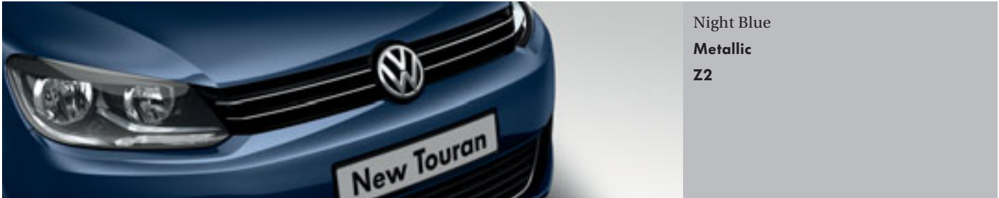
Night Blue Metallic Z2