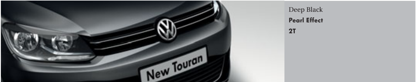
Deep Black Pearl Effect 2T