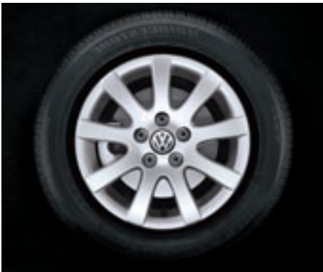
15 inch ‘Misano’ alloy wheels with 195/65 R15 tyres add a sporty look to the exterior and are protected by anti-theft wheel bolts. Standard on S and S BlueMotion Technology models. S BlueMotion Technology models feature 195/65 R15 low rolling resistance tyres as standard.

The new Touran is designed to offer you the ultimate in flexibility, with a range of versatile equipment and a host of refinements to ensure it meets your every need. Whether you’re doing the shopping, taking the family on holiday or ferrying the football team around, its flexible interior provides a wealth of practical solutions for every situation, while its incredible spaciousness and high standards of luxury ensure you travel in style, whatever you’re doing.