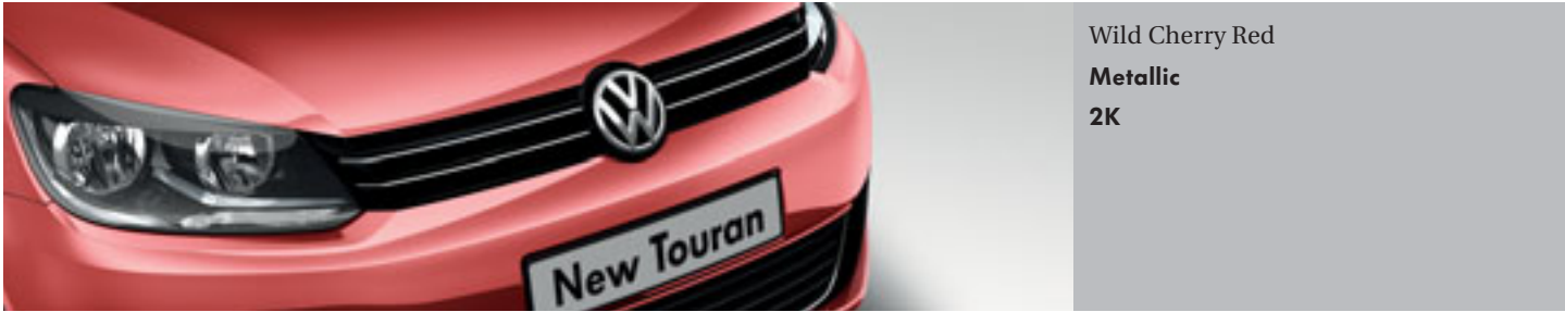
Wild Cherry Red Metallic 2K