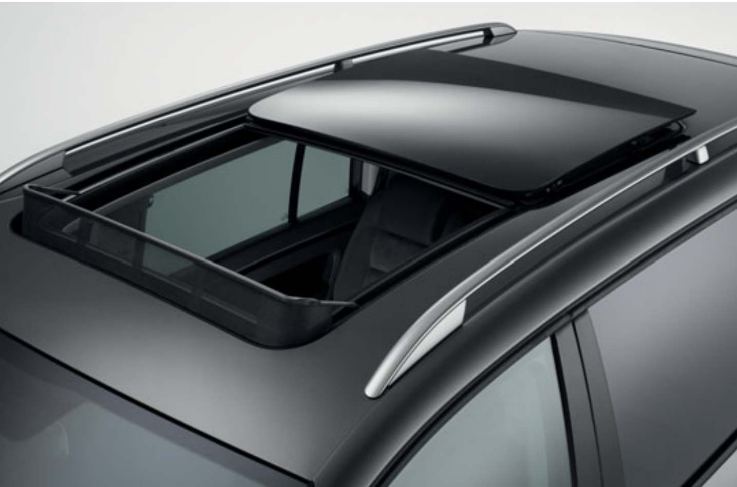
The electric panoramic glass sunroof gives an uninterrupted view of the sky above, filling the interior with natural light and providing an extra dimension of light and space. Easily operated and adjusted via the practically located control panel, it also includes a wind deflector, enabling you to enjoy the sun and fresh air on faster journeys, while tinted glass ensures a pleasant interior temperature even in strong sunlight. Should you wish to stay out of the sun, yet still enjoy fresh air, an integrated roller blind can be used while the sunroof is open. Optional on all models.