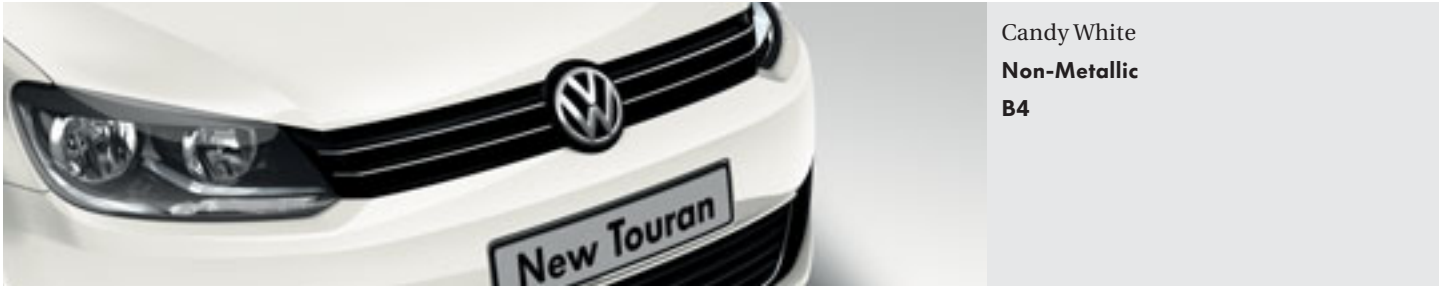
Candy White Non-Metallic B4