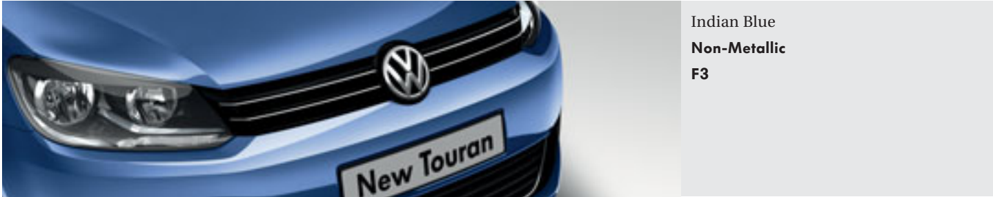
Indian Blue Non-Metallic F3