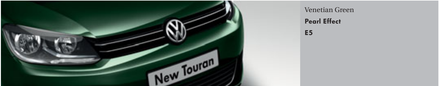
Venetian Green Pearl Effect E5