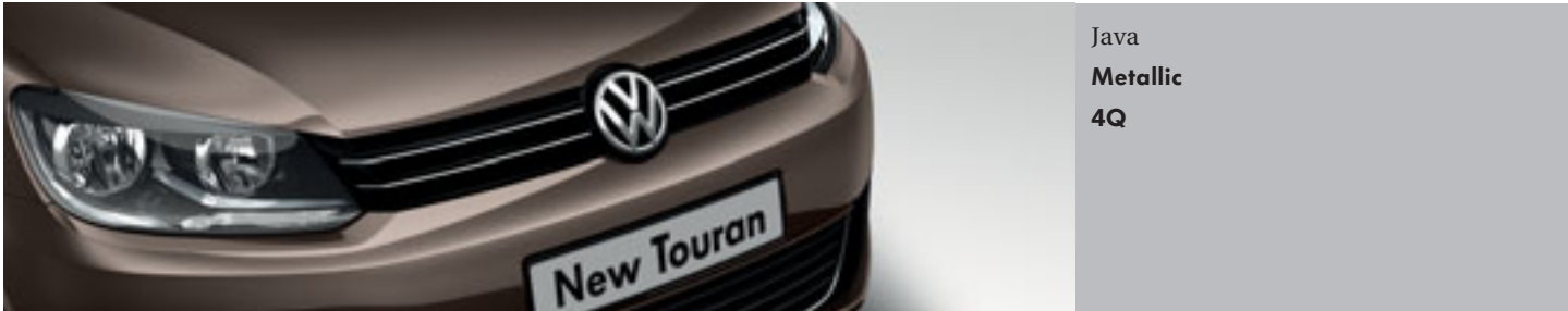
Java Metallic 4Q