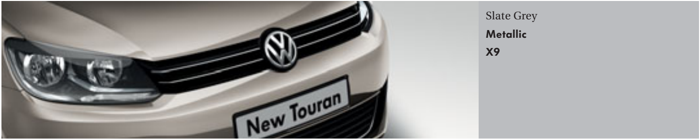
Slate Grey Metallic X9