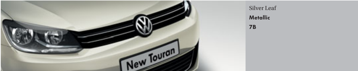
Silver Leaf Metallic 7B