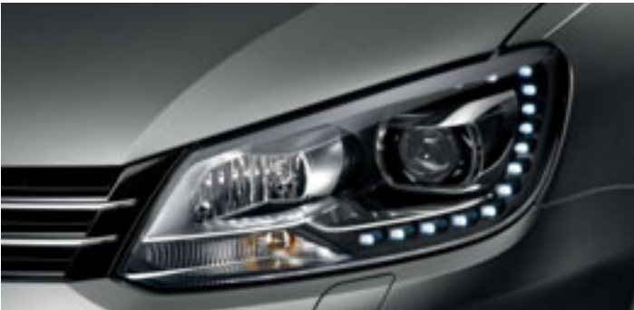
Bi-Xenon headlights including automatic range adjustment, dynamic curve lighting and headlight washers ensure the optimum headlight setting and illumination of the road ahead. Light distribution of the dipped beam is matched to speed, so that a longer light beam is emitted when the vehicle is driven faster for improved illumination and LED daytime running lights ensure your vehicle is more visible during the day. Optional on all models.