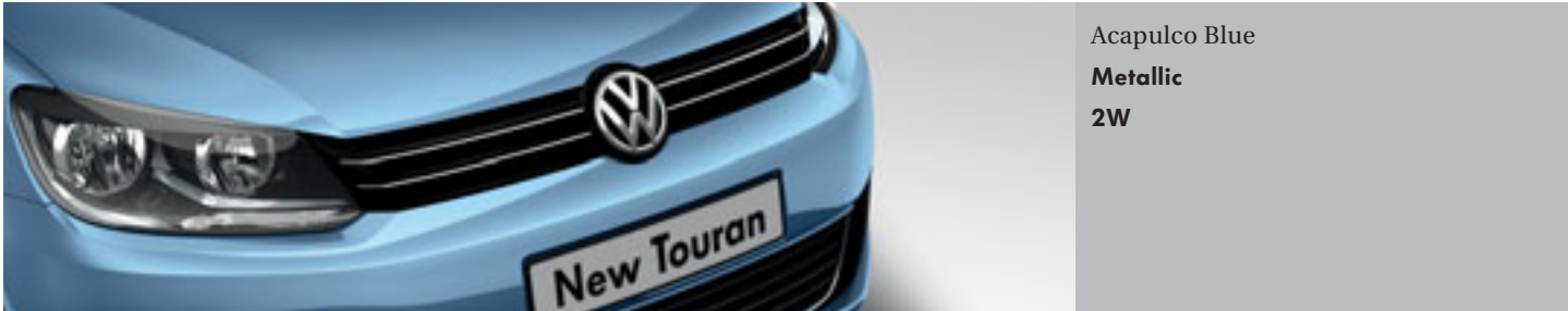
Acapulco Blue Metallic 2W