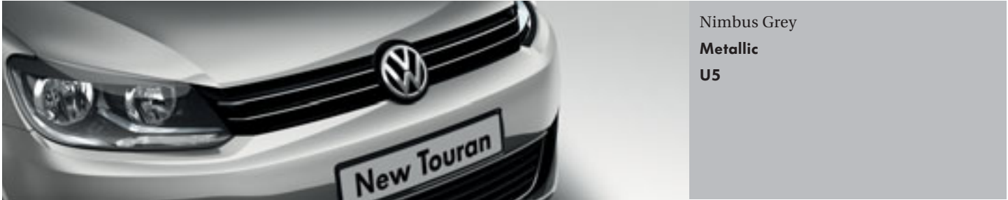
Nimbus Grey Metallic U5