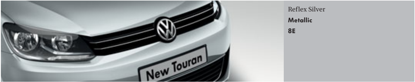
Reflex Silver Metallic 8E