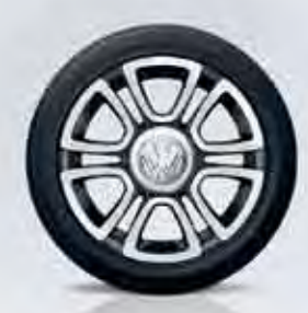
'Triangle Black' alloy wheels 6J x 16, 185/50 R16 tyres | Optional – High up! as part of the Sports pack