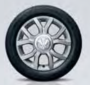
'Waffle' alloy wheels 51/2 J x 15, 185/55 R15 tyres | Optional – Move up!