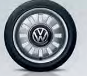
'Classic Black' alloy wheels 6J x 16, 185/50 R16 tyres | up! black