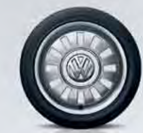
'Classic' alloy wheels 'Trian 6J x 16, 185/50 R16 tyres 6J x 1 | Optional – High up! | Option