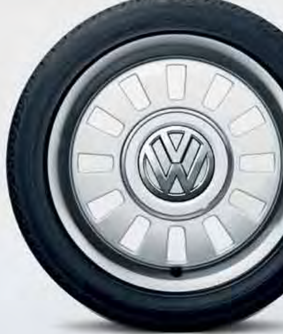
Alloy shown is 'Classic White'.