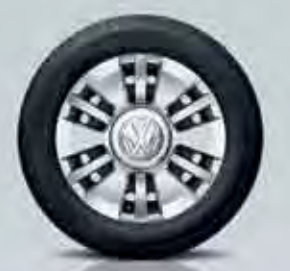
Steel wheels 5J x 14, 165/70 R14 tyres | Move up!