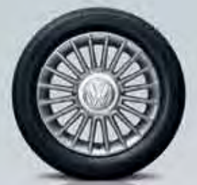
'Spoke' alloy wheels 51/2 J x 15, 185/55 R15 tyres | High up!