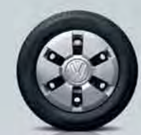
Steel wheels 5J x 14, 165/70 R14 tyres | Take up!

Whether full size wheel trim or alloy, from 14 to 16 inch, sporty or elegant – every design was created especially for the new up!