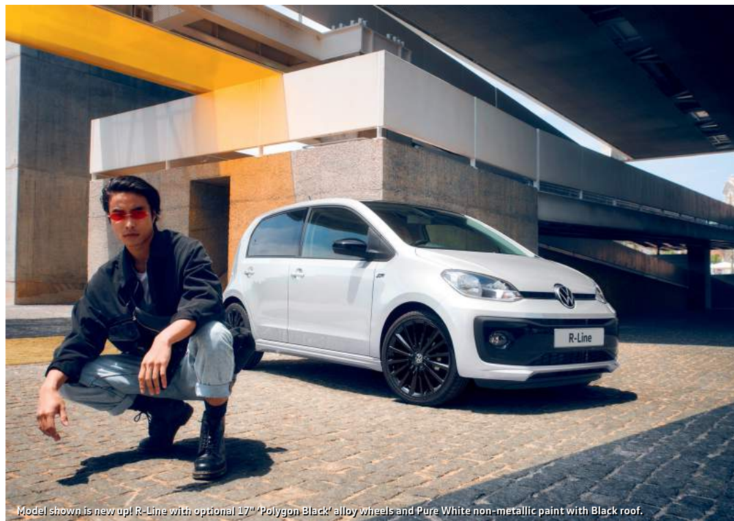
Model shown is new up! R-Line with optional 17" 'Polygon Black' alloy wheels and Pure White non-metallic paint with Black roof.

Smartphone answering via multifunction steering wheel with audio over the vehicle speaker system