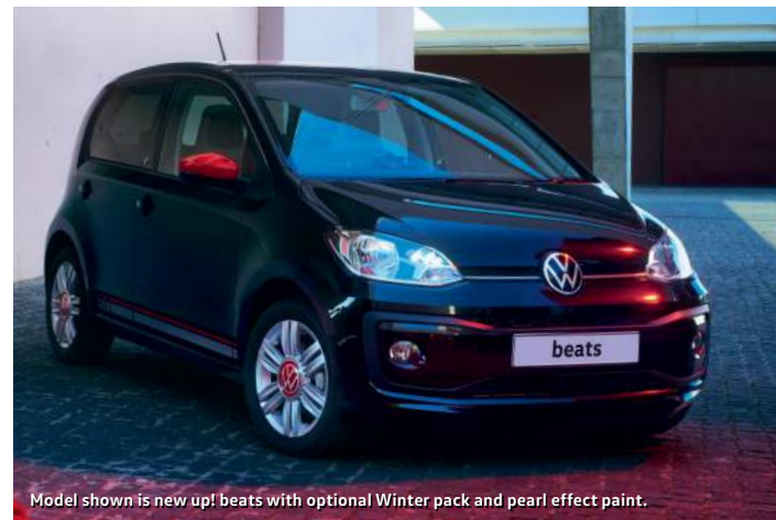
Model shown is new up! beats with optional Winter pack and pearl effect paint.