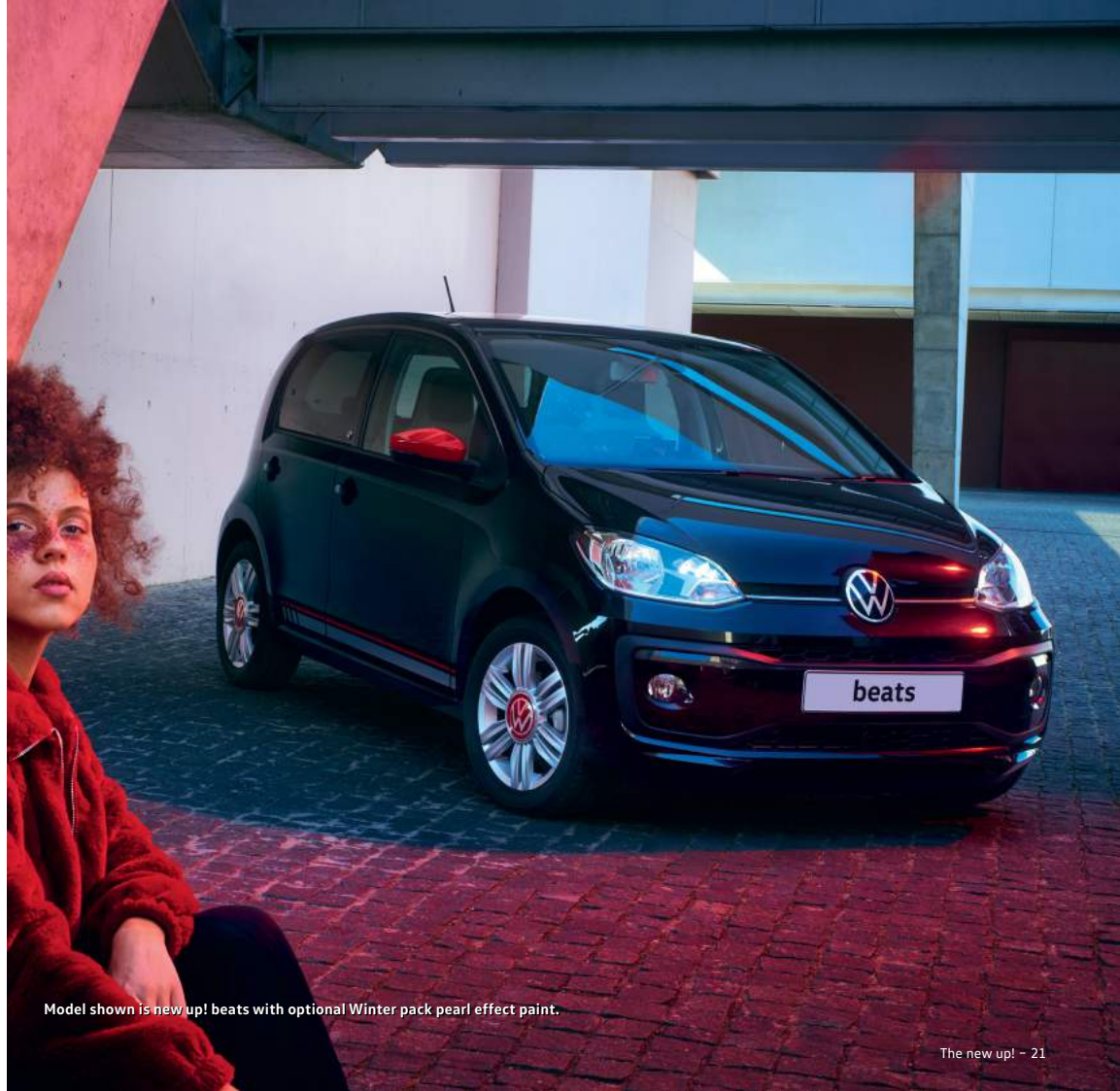
Model shown is new up! beats with optional Winter pack pearl effect paint.