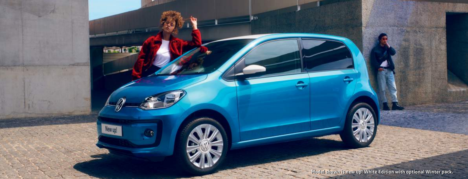
Model shown is new up! White Edition with optional Winter pack.